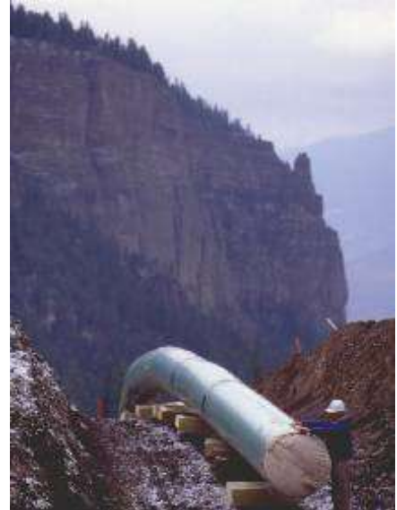
Figure 1 Natural Gas Pipeline

Although mainline natural gas compressor stations vary widely in size and layout, the basic components of such a station include compressor units, scrubber/filters, cooling facilities, emergency shutdown systems, and an on-site computerized flow control and dispatch system that maintains the operational integrity of the station. Most compressor stations are unmanned and monitored by an off-site Supervisory Control and Data Acquisition (SCADA) system that manages and coordinates the operations of the several compressor stations that tie together a natural gas pipeline system.