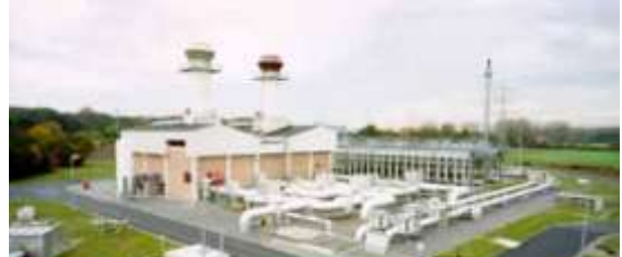
Figure 3 Natural Gas Compressor Station

Panhandle Energy is one of the largest 2500 Series™ users in the natural gas transmission industry. Panhandle Energy Companies operate more than 15,000 miles of pipelines that transport natural gas from the Anadarko and San Juan basins, Rocky Mountains, Gulf of Mexico, South Texas and Mobile Bay to major markets in the Southeast, Midwest and Great Lakes region. At a typical compressor station, Panhandle employs CTI 2500 Series™ products to provide reciprocating engine control, turbine/compressor control, combustible gas and flame detection, and overall compressor station control. The specific processes include lubrication and cooling system controls, sequential start/stop operations, pressure and flow control, unit speed control, air/fuel ratio control, alarm and shutdown systems. The systems include a wide range of 24VDC and 120VAC I/O, RTD and thermocouple inputs, and analog I/O. The systems also support communications using Ethernet, Modbus for communications with equipment within the station and externally to the SCADA system.