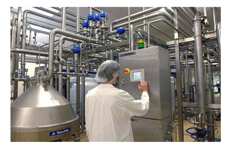
Modern cheese making factories use a high level of automation

Together with the ECC1 communication card, it was decided to replace also the Simatic 555 CPUs in order to solve problems of obsolescence and obtain better performance and memory resources. These enhancements were made without having to change any of the I/O's or PLC bases, which made the investment for the customer considerably lower than solutions from other automation suppliers.