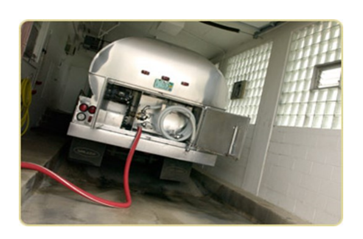
Tank truck unloading fresh milk

On Saturday morning the first CPUs and ECC1 cards were installed in a few smaller PLCs. The installation went smoothly and in the afternoon the engineers felt confident to also migrate the Pasteurization PLC. The biggest challenge here was to get the PLC back into the same process state as it was before the shutdown, but since the program backup from the original CPU could be used to reload the new CTI CPU without making any changes to the program, this replacement also went quite smoothly and the pasteurizer was up and running again before the planned production stop of 4 hours had been reached.