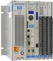
Figure 5: New CTI 2500 Series System

After reviewing CTI's findings and recommendations, plant and production managers had a better understanding of the reasons for the problems they had been seeing with the Ethernet cards. They were also pleased to discover that they could "refresh" and modernize their control systems with no rewiring or reprogramming, little to no downtime, minimal risk and low cost by simply swapping out aging modules for their brand new, updated CTI replacements.